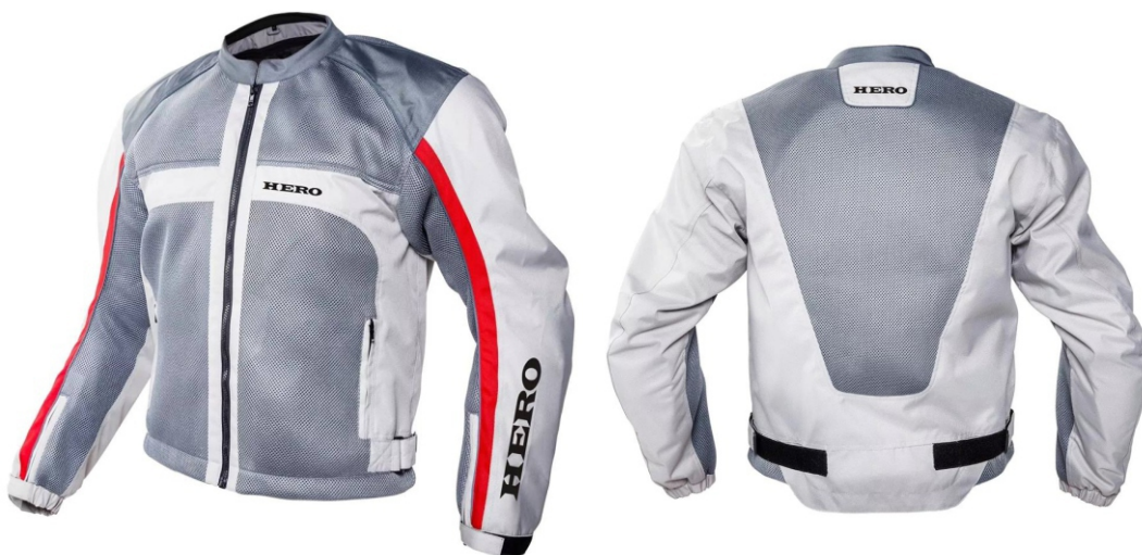
Ref: HR-76 UOMO