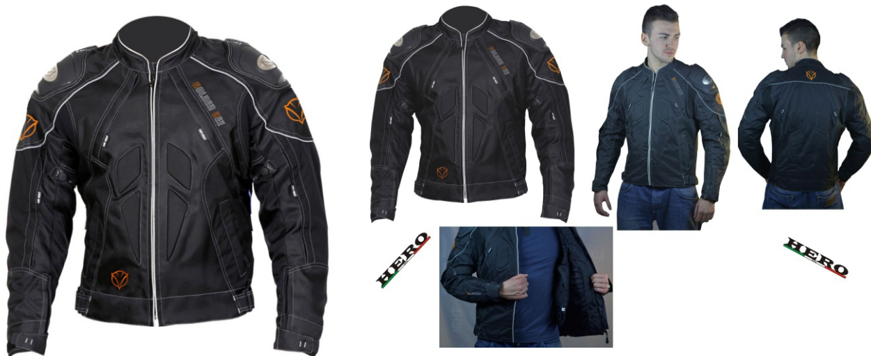
Ref: HR-892 JOHN PLAYER