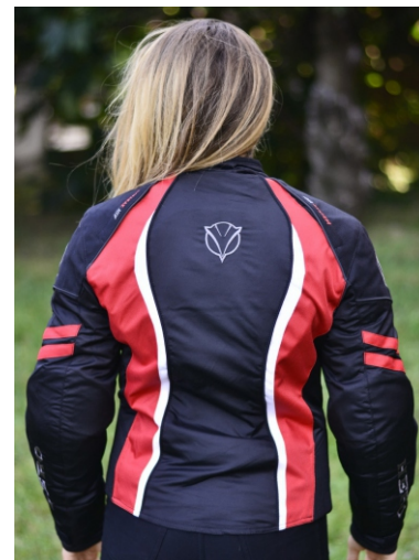
Ref: HR-1002 BUTTERFLY