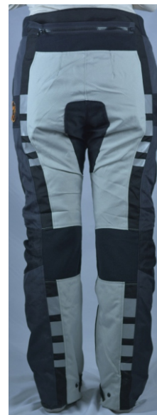
Ref: HR-920 BULBUL-LADY