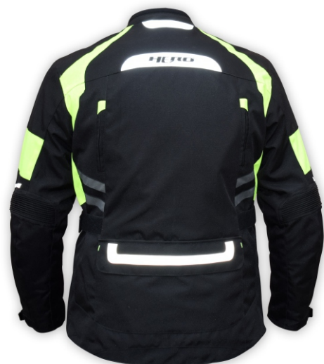
Ref: HR-18-3017 CORSA RIDER GT-1