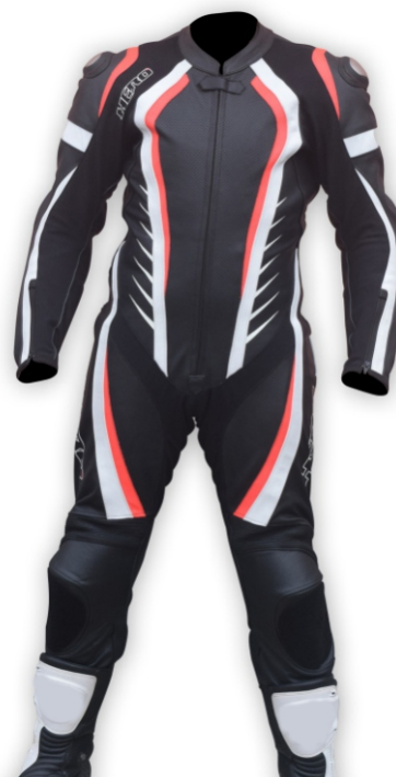
Ref: HR-9057 ONE PIECE LEATHER SUIT RACING MISANO