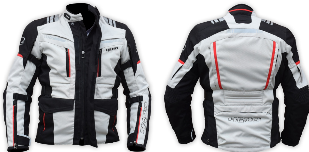
Ref: HR-18-3016 WP-TECH MEN