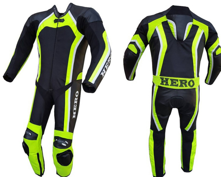
Ref: HR-17-25 MINI MOTO