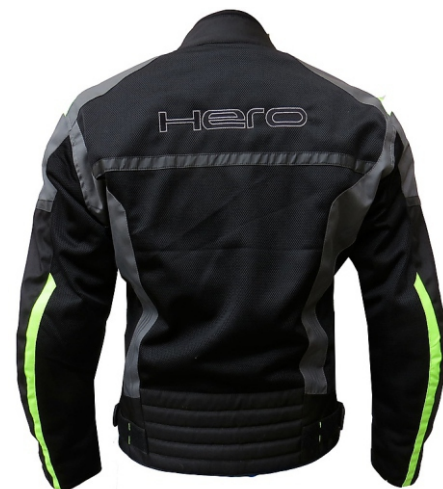
Ref: HR-876 HERO-4