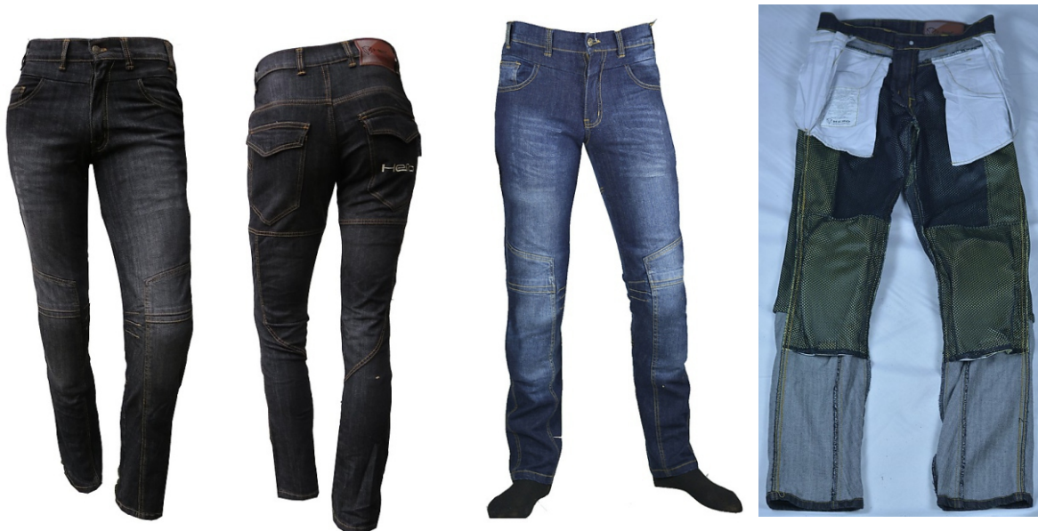
Ref: HR-786 JEANS IN KEVLAR UNISEX