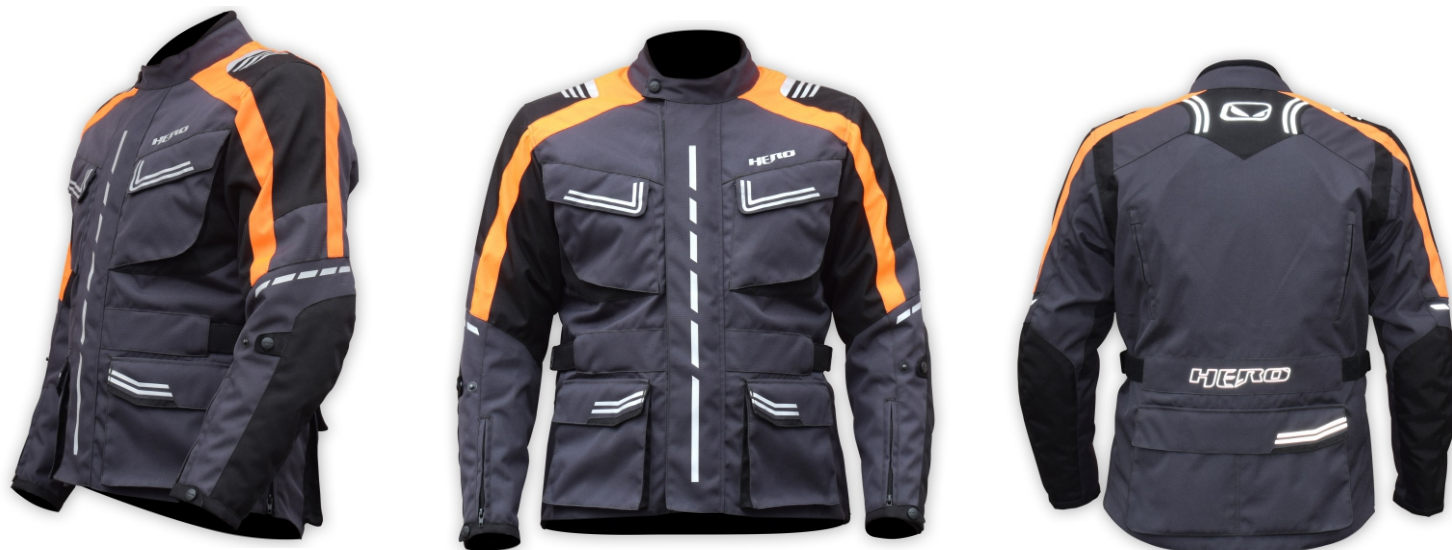
Ref: HR-18-3018 CORSA GT-12