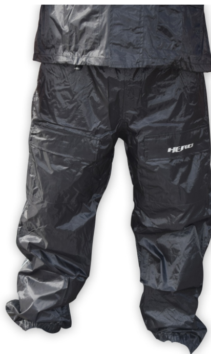
Ref: HR-1116 RAIN SUIT