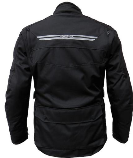
Ref: HR-17-874 Giacca Uomo RINGCUT-NERO