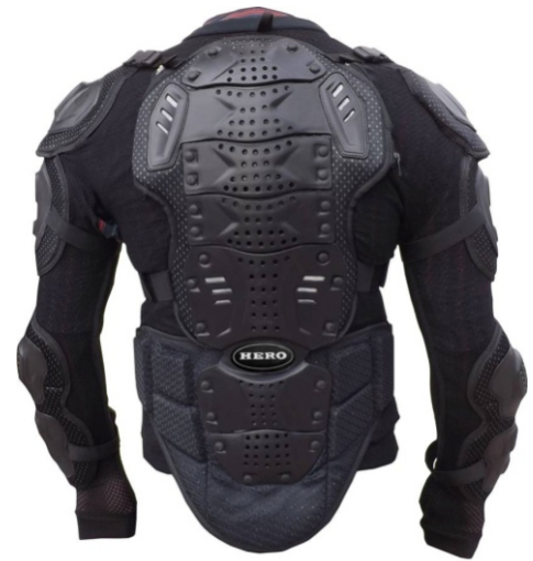
Ref: HR-2029 ADULT