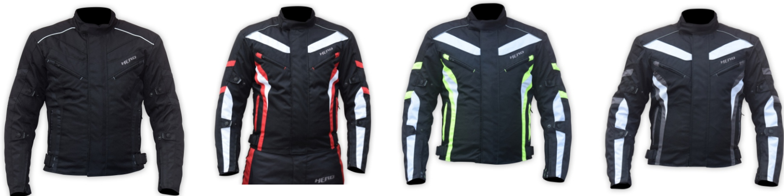
Ref: HR-3435 CORSA RIDER 1-2-3-4