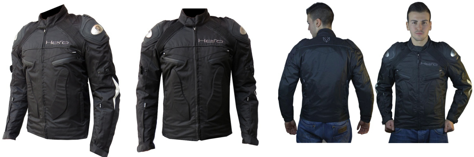
Ref: HR-894 BHOOM