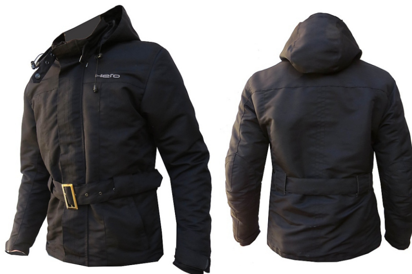
Ref: HR-17-897 HERO-MEN