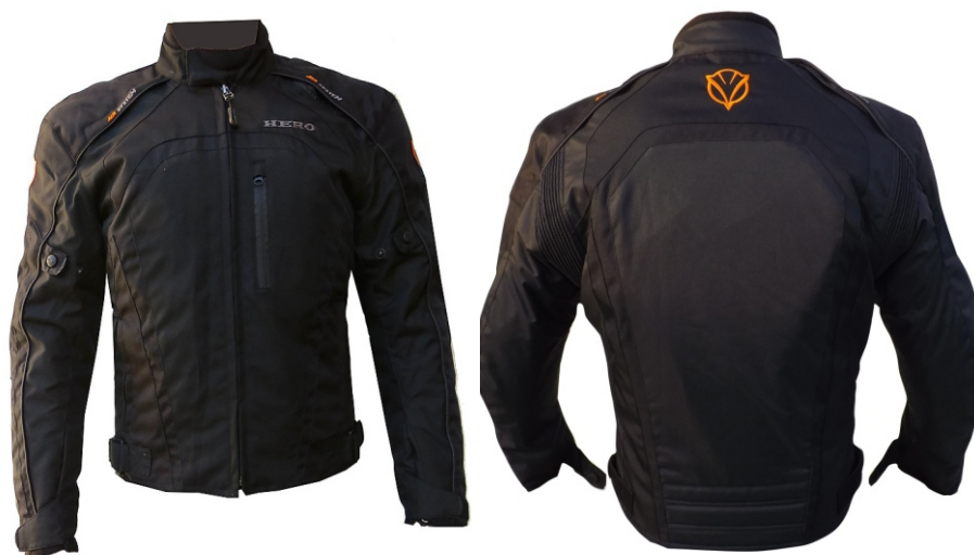
Ref: HR-884 WINSTON