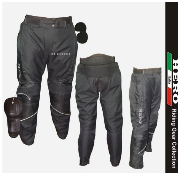
Ref: HR-916 BABY-DOL