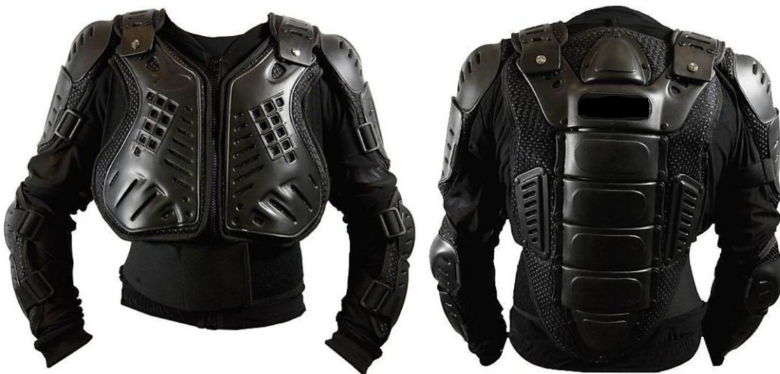
Ref: HR-2028 children