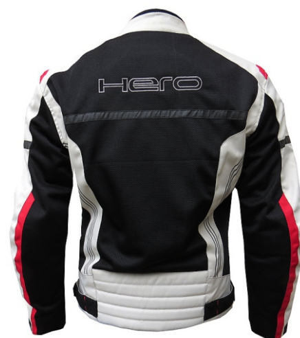
Ref: HR-874 HERO-2