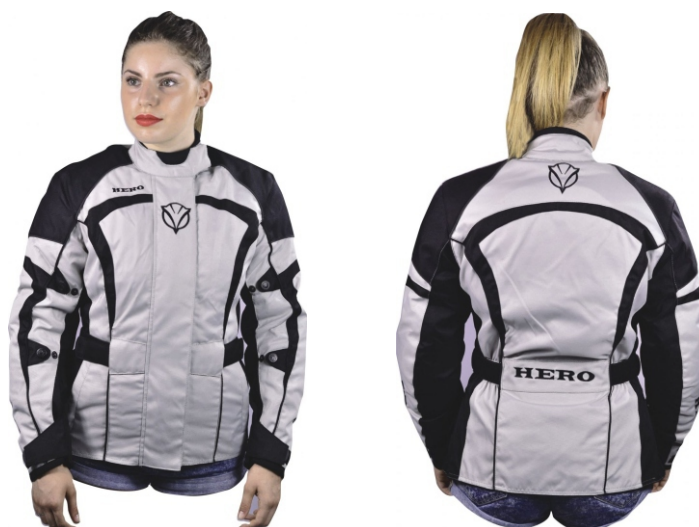
Ref: HR-1006 CHIKNI