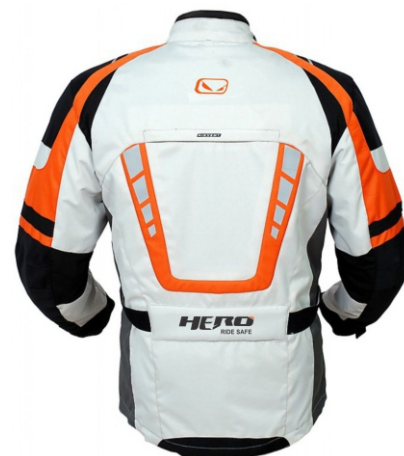
Ref: HR-111 HEDGES