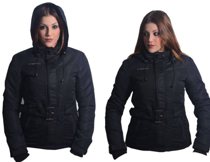
Ref: HR-17-896 HERO-LADY