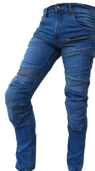
Ref: HR-777 JEANS IN KEVLAR UNISEX