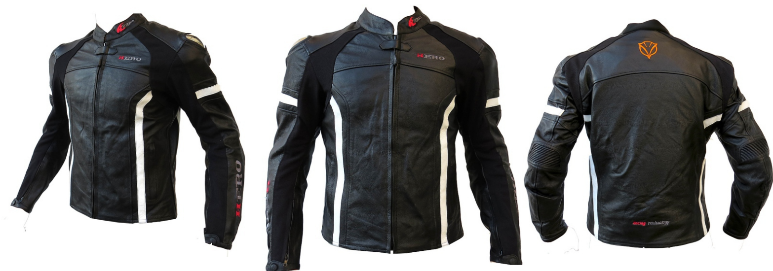
Ref: HR-7010 LEATHER JACKET STELVIO